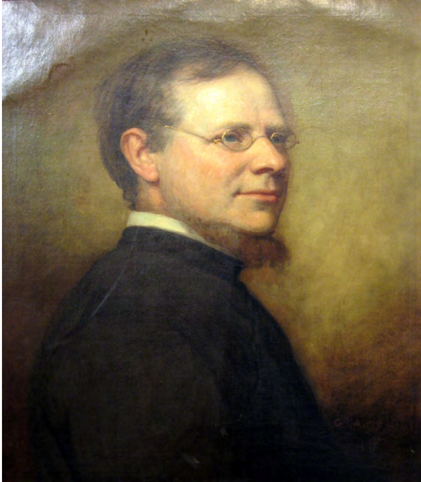
Servant of God, Isaac Thomas Hecker (1819-1888) Founder of the Paulist Fathers