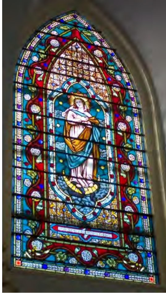
The Immaculate Conception of the Blessed Virgin Mary Central Stained Glass Window in the Apse of the Church